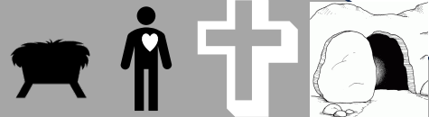
Jesus, the Christ, Son of God