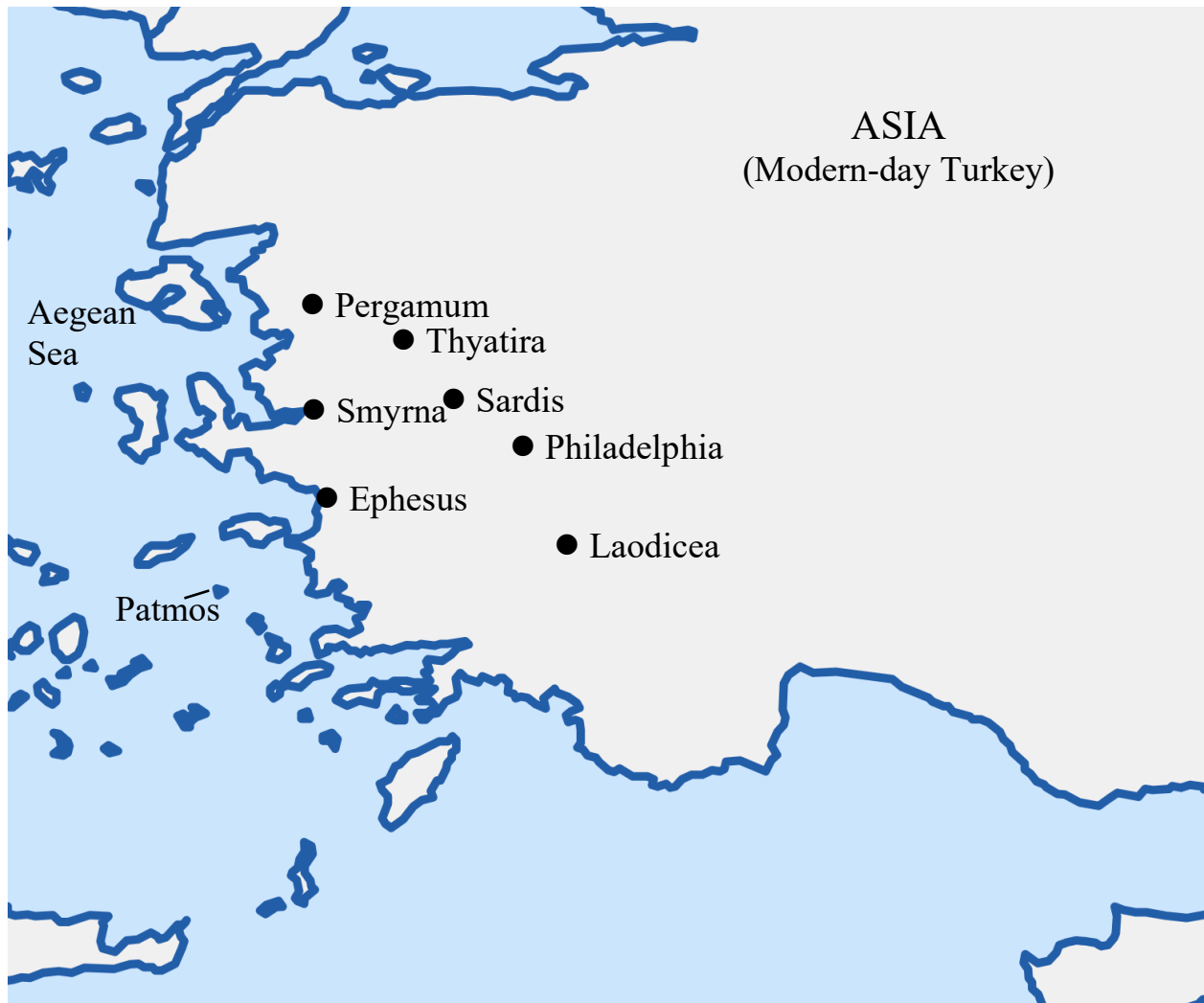
Figure 13-2 Locations in Revelation 1-3

Patmos is a small island of just over 13 square miles. (For comparison purposes, Boise, Idaho is about 85 square miles; Kuna, Idaho is about 20 square miles.) In the first century, Patmos was one of several islands to which Roman emperors exiled their opposition.