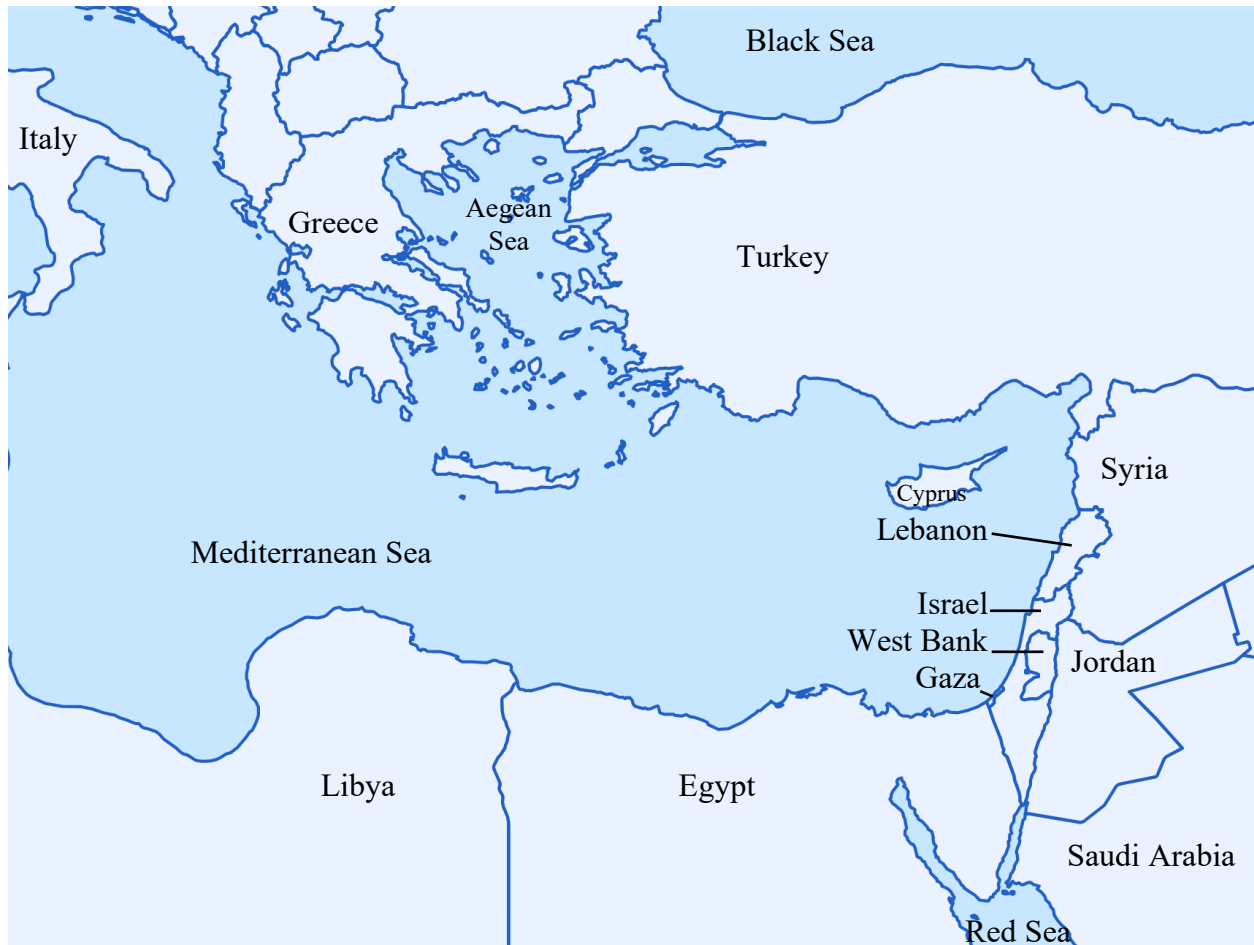
Figure 13-1 Modern-day Countries

The church locations mentioned in Revelation 2 and 3 were in western modern-day Turkey. Patmos is a Greek island off the western coast of Turkey. See Figure 13-1 to orient yourself and then examine Figure 13-2 for a closer look at the region.