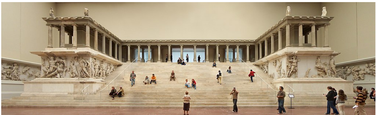
Altar to Zeus Pergamon Museum, Berlin Figure 16-2

The most recognizable artistic artifact, the Altar to Zeus, was located in proximity to the Athena temple. See Figure 16-2.