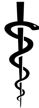
Rod of Asclepius Figure 16-4