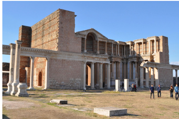
Bath-Gymnasium (late 2 nd , early 3 rd century AD)