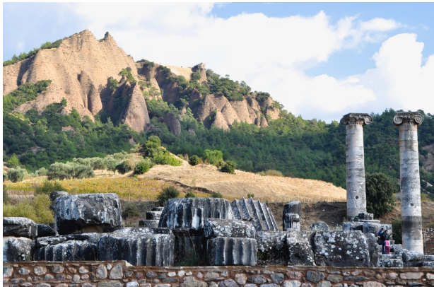
Upper City Ruins, Mount Tmolus in the Background

By the time Sardis was part of the Roman empire, it was well known for wool trading and dyeing wool. There was a bustling textile and clothing trade in Sardis.