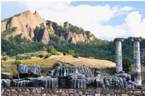
Upper City Ruins, Mount Tmolus in the Background

By the time Sardis was part of the Roman empire, it was well known for wool trading and dyeing wool. There was a bustling textile and clothing trade in Sardis.